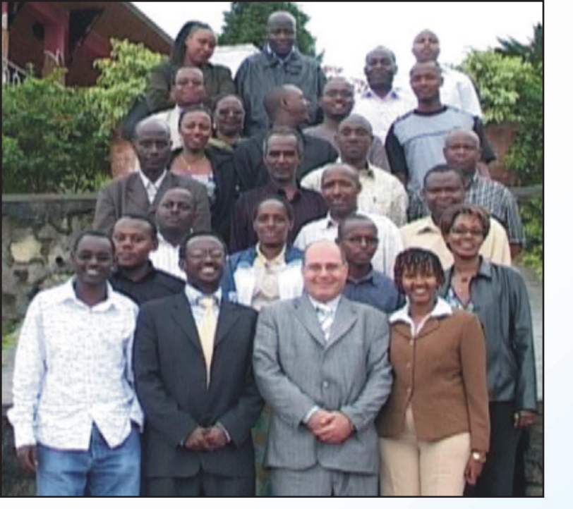
NISR staff workshop at Rubavu in march, 2008