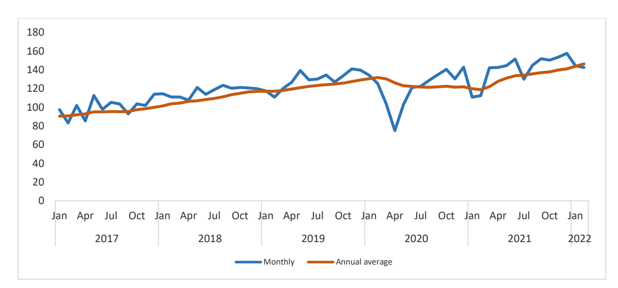
Chart 1: Index of Industrial Production (formal activity) constant 2017 prices